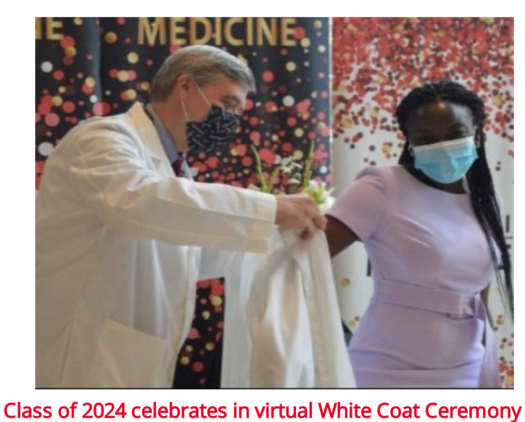
The Class of 2024 celebrated the receipt of their white coats during a virtual

White Coat Ceremony. First-year classes normally hold their White Coat Ceremony the last day of their orientation week, but this year's event was postponed due to the pandemic.