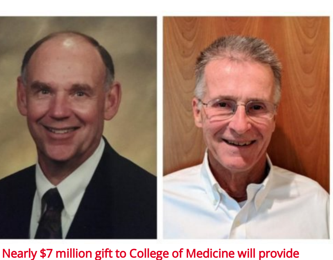
full-tuition scholarships for 40 medical students A pledge of nearly $7 million to the College of Medicine is one of the largest

donations supporting student scholarships in the college's history.